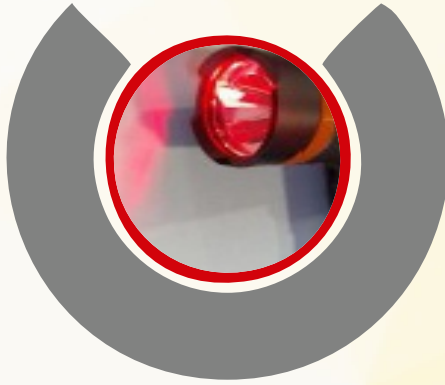
Red LED Light