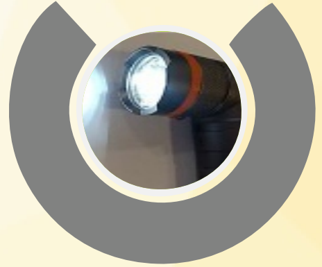
White LED Light