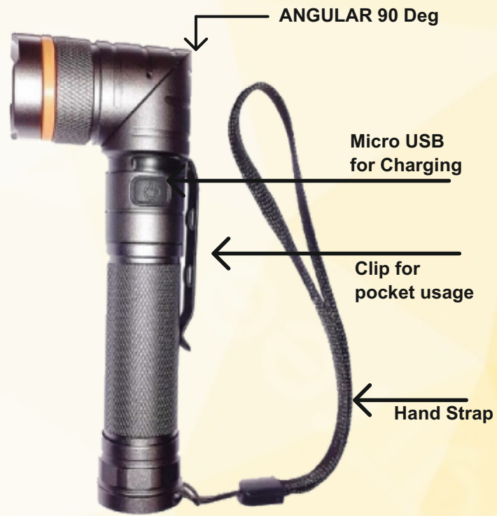
Angular 90 Degree

Necessary NABLTest Reports are available