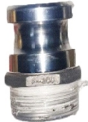
633 Female Adaptor