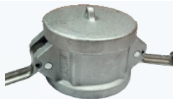
634 B Dust Cap