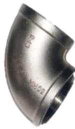
90 Deg. STEEL ELBOW