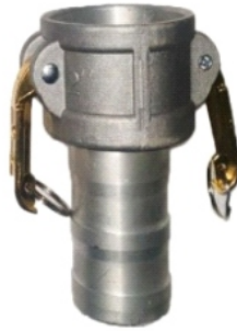
633 B Male NPT Coupler